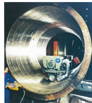
Grinding of a surface clad pressure vessel for ultrasonic testing.