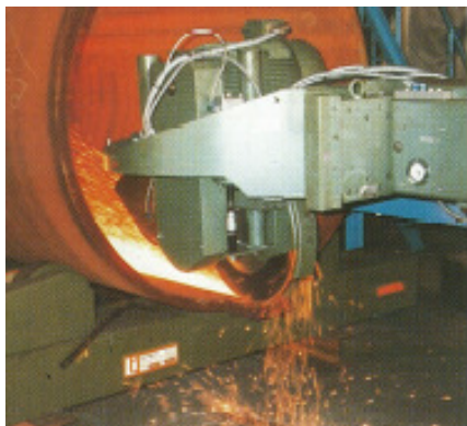
Back gouging on a longitudinal weld seam.

Machine for the back gouging and surface grinding of vessels. Used machine, year 1980, brand Farros Blatter Typ BSA-3185/350, 2250 hours of operating service, rebuilt in 2013.